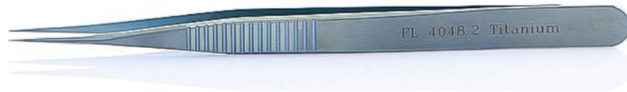
Micro Jeweler Style Forceps